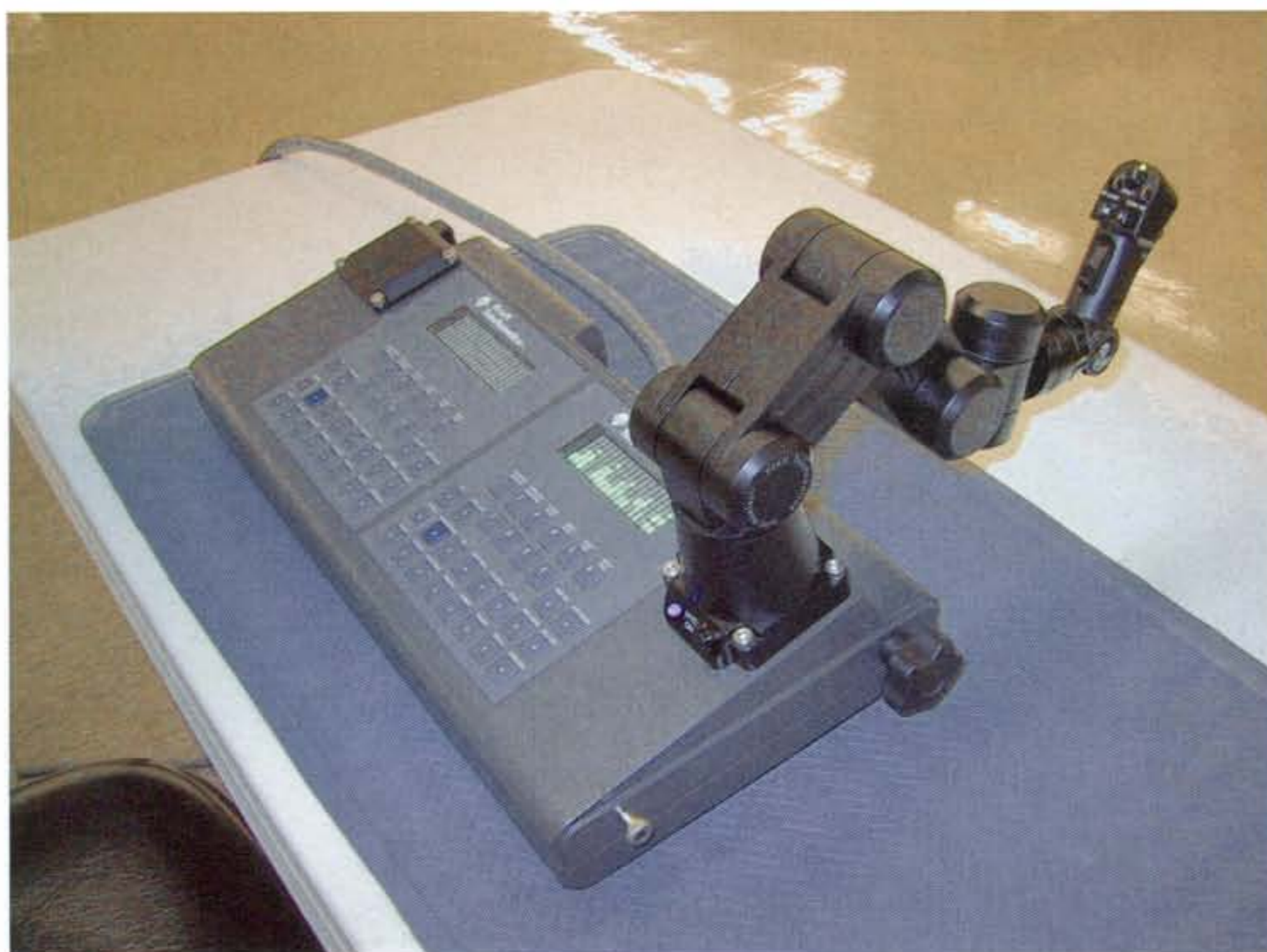
Kraft 6-DOF force feedback mini-master with console