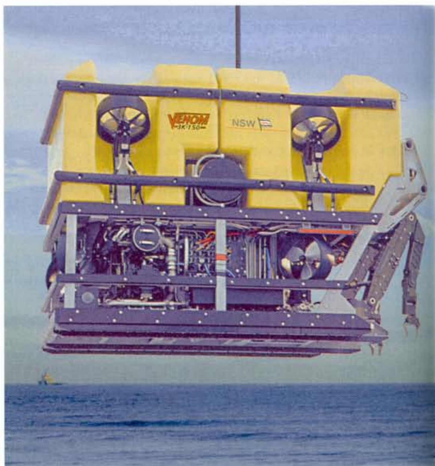
Hydrovision Venom ROV equipped with two Kraft Predator II force feedback manipulator arms

As the next generation manipulator for deep ocean work, Predator II is the culmination of 20 plus years of experience and everything Kraft has learned from listening to its customers. At the heart of the Predator II system is a new 6 DOF force feedback mini-master controller, the vital link between the operator and the remote manipulator arm. Nothing is more important than the method of control, and the Kraft mini-master allows the operator to control complex manipulator motions in a comfortable and intuitive manner.